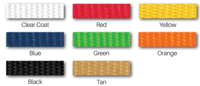
NFPA colors available